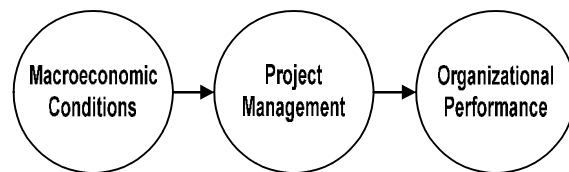
FIGURE 1: Research Model

For the purpose of this study, data was gathered previously, immediately following the preliminary studies in project management and entrepreneurship (Anantadjaya and Mulawarman, 2010). The period of coverage in this study spans from 2009-2012 (only the first quarter). As noted in the preliminary studies, Firm A is an automotive firm in Indonesia that manufactures vehicles, distributes vehicles and spare-parts. Its production plant is located in the outskirts of Jakarta. Firm A is a foreign direct investment firm, and it is the sole agent, assembler, and manufacturer of a certain brand of vehicle. For the purpose of this paper, after-sales services (spare-parts) become the focus in trying to learn the causes of project overrun, including the likelihood on operational and asset inefficiency. In addition, this study also relies on information obtained from locally owned automotive firms, mainly focusing in body shops and engine overhaul works. Those locally owned firms are; Firm B, Firm C, and Firm D, which are all located in Jakarta and Bandung. Aside from noting the differences in handling project management in a foreign direct investment firm and